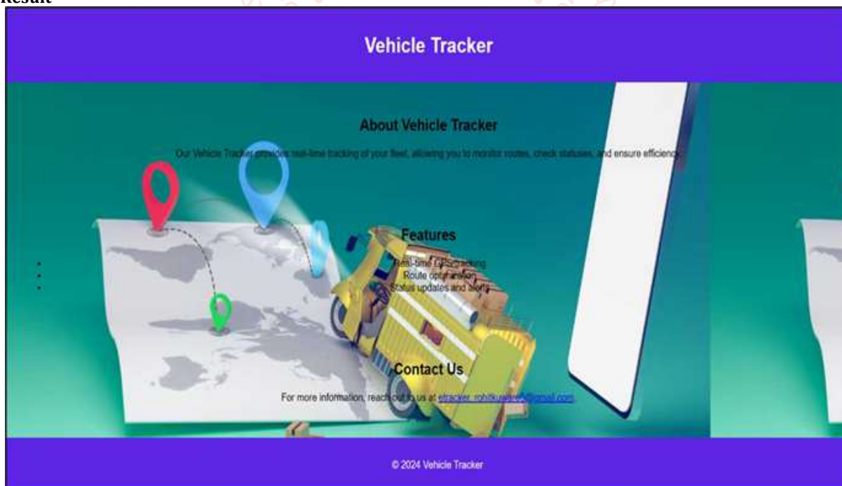
Fig 3. Tracking System Using Iot