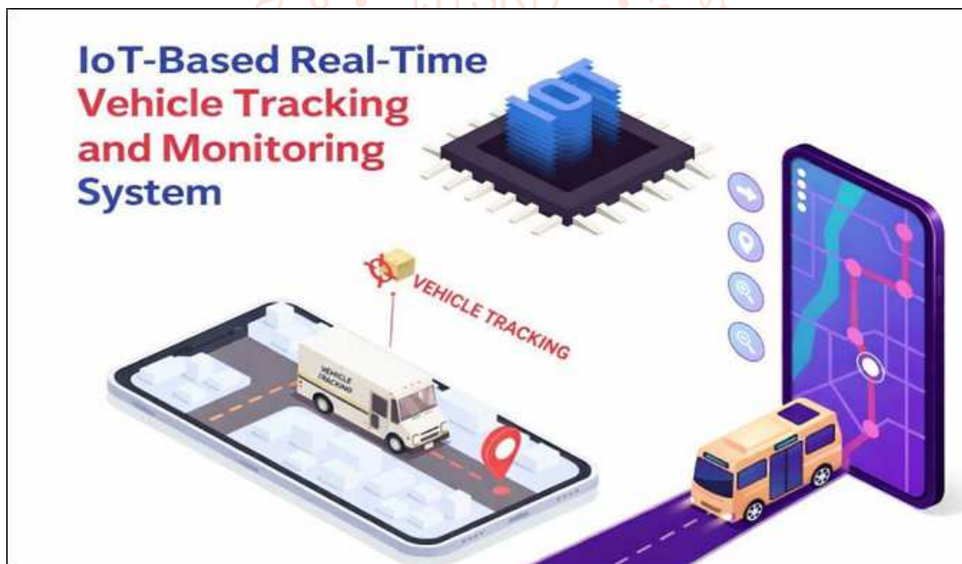
Fig 1. System Architecture