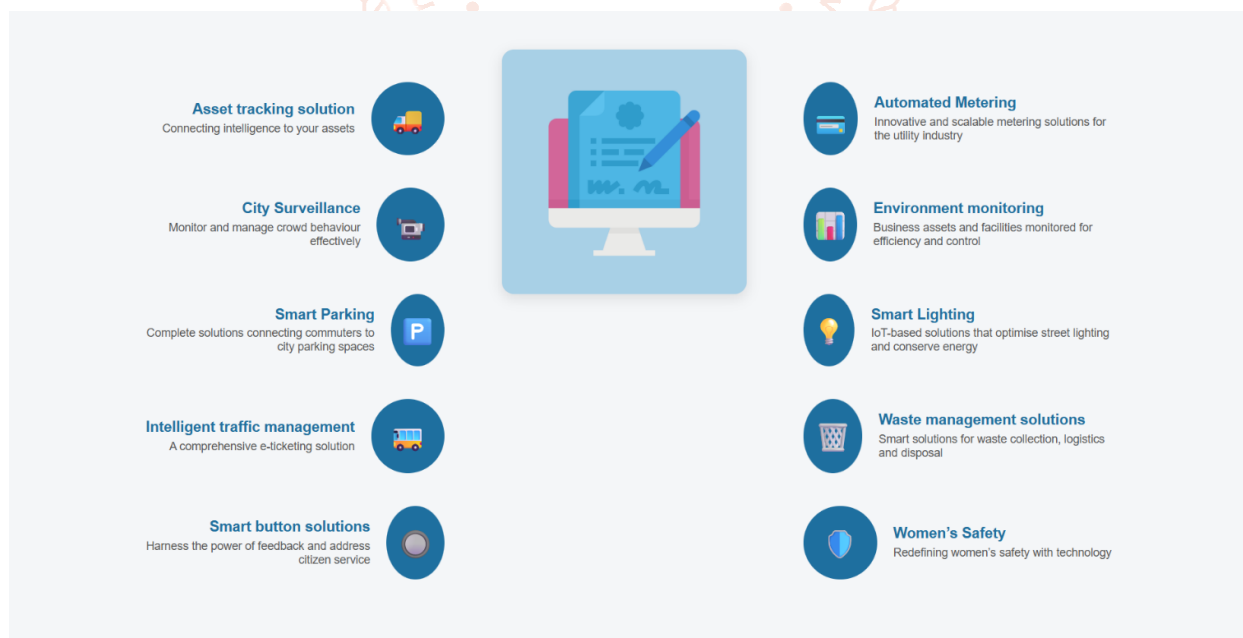
Fig.2 How IOT Transforms Urban Life