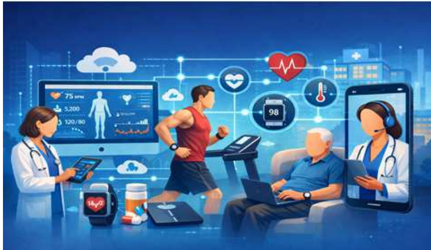
Fig 1: IoT in Healthcare

body data flows nonstop into the network. If numbers climb too high, warnings pop up right away [12]. Up front, a clean screen shows only what matters, stripped of clutter. Spotting small shifts in bodily function happens sooner thanks to unbroken monitoring; at the same time, smart prompts adjust quietly as habits shift over days. Encryption built strong keeps information private while cloud systems grow smoothly across demands [4] [9]. Right at the core of this setup, people come first - shaping health tools around their real-life needs instead of adding them as an afterthought.