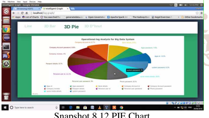
Snapshot 8.12 PIE Chart