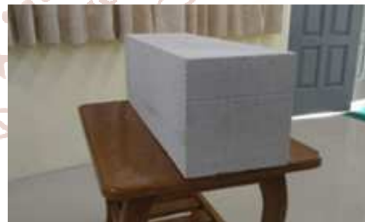
Fig.1. AAC block

The photographic view of the AAC blocks (1) length-600mm, height-200mm, thickness-200mm, Cost-1800 kyats and (2) Length-600 mm, Height-200 mm, Thickness-100 mm, Cost-950 kyats are shown in Figures 1 and 2.