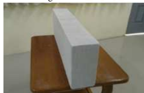
Fig.2. AAC block