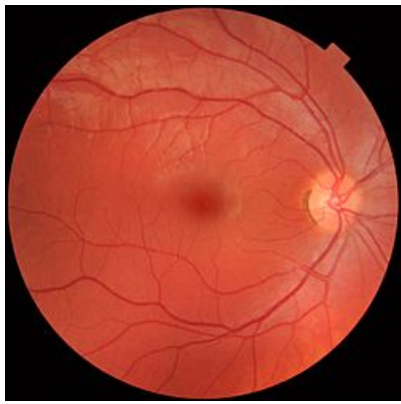
Fig: Fundus retinal image

doctor uses a small evicse with a light on the end to light and magnify the optic nerve,If the pressure range is not up to the normal level,it shows the optic nerves unusual.