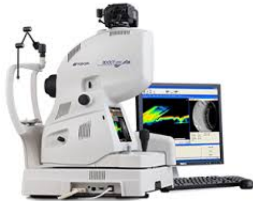
Fig: Gonioscopy machine