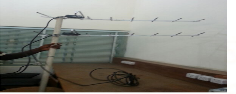
Figure 2: Vertical dual-stacked antenna

When Yagi antennas are stacked, there is an increase in gain and a decrease in the beam-width. The increased gain is due to the reduction in beam-width. There are two types of stacking namely; vertical stacking and horizontal stacking (Blake, 1996; Balanis, 2005, 2008). Stacking two identical antennas on a common vertical mast as seen in Figure 2 significantly narrows the vertical beam-width angle. That is, vertically stacked antennas effectively reject those interfering signals arriving from above or below their horizontal plane than that of a single antenna. In this process, gain increases with about 2.5 dB over that of a single antenna (Straw, 2000).