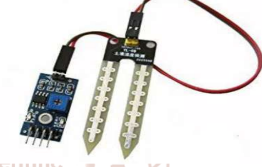
Fig. 3. Assembly of Sensor

A Sensor is an electronic device used to detects and generate signals as a form of input from its surroundings. The specific input could be light, temperature, motion, moisture, pressure, or any one of a great number of other environmental phenomena. It converts the physical parameters (temperature, humidity, etc) into a signal which can be measured electrically. Sensors are used in daily objects such as touch-sensitive elevator buttons and lamps which weak or brighten. The sensitivity of the sensor is used to measure the variations in the generated output with respect to the measured input. The assembly of sensor is shown below: