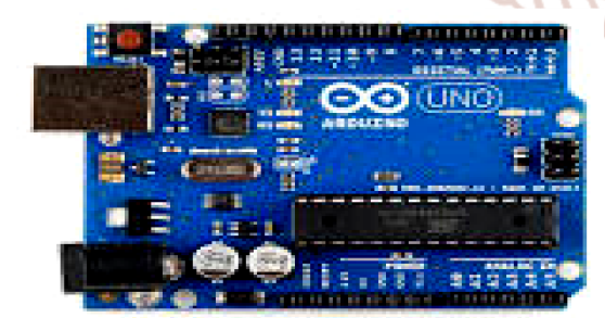
Fig. 2. Assembly of Arduino UNO board

The arduino Uno is a microcontroller board based on the ATmega328. It consists of 14 digits input/output pins, (i.e.) 6 analog inputs, 8 analog outputs, a ceramic resonator with a range of 16MHZ, a USB connection, a power jack and a reset button. The rch and arduino UNO can be powered via the USB link or with an exterior power supply. The power source is 4.3 Comparator : selected automatically. Arduino is one that is an established open source computer hardware and A comparator circuit compares two voltages and software company and user community that is used for manufacture and design of single-board microcontroller and microcontroller kit to build digital and interactive objects for sensing and controlling objects in real time applications.