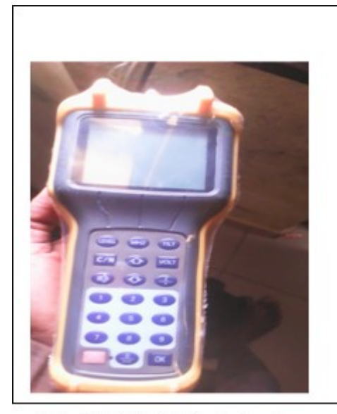
Plate 1: Digital CATV signal strength meter