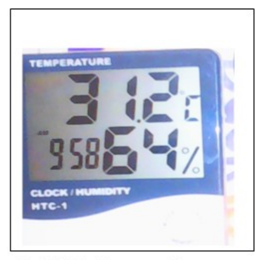
Plate 2.0: Digital thermometer/hygrometer